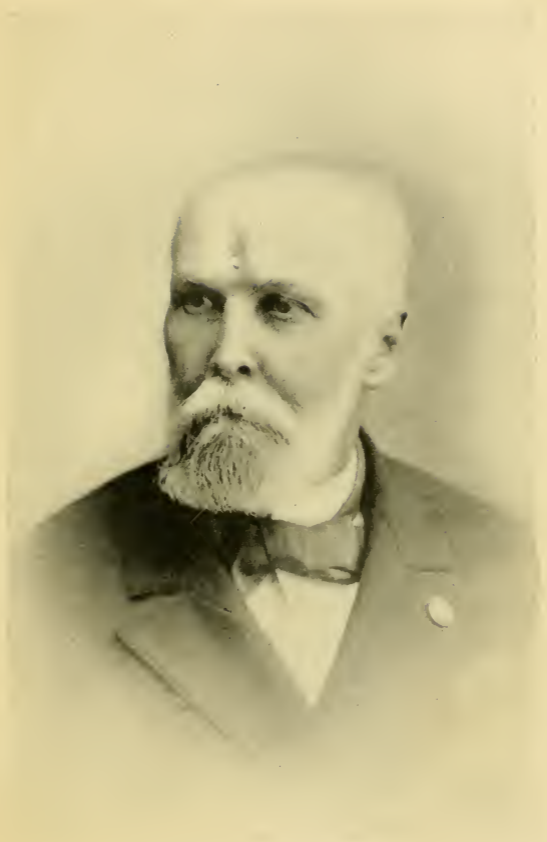
GENERAL CALIXTO GARCIA